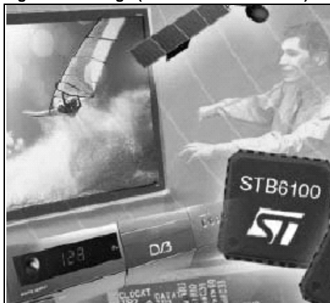
Figure 2. Integrated silicon tuner